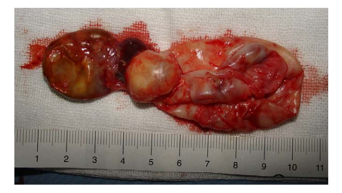
Fig. 2. The polycystic mass was totally resected, nearly 10 cm in diameter.

Intracranial AVF more frequently occur on the dural tissue as compared with those that occur in the cortex. Arteriovenous fistula is rare in clinic, accounting for only 1.6% to 3.1% of that of cerebral AVM [3]. The most common symptoms are closely related to the hemodynamic changes of the fistulae, such as increased intracranial pressure due to the large volume of blood flow in the intracranial sinus system, exophthalmos resulting from the stealing of blood from the cavernous sinus, congestive heart failure due to the increased returned blood volume to the heart mostly in children, and so forth. In large and giant cases of fistulae,