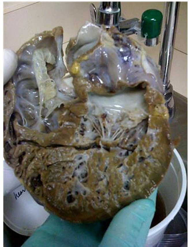
Figure 3 Postmortem examination of the heart. (Right) Left ventricle with noncompacted myocardial tissue and evidence of organized thrombi.

and severe dilated cardiomyopathy. This quickly progressed to cardiac arrest and brain death. Such a fulminant and tragic presentation of IVNC in a previously healthy and physically fit individual has not yet been described. The case brings to light many of the complications of IVNC, including atrial (and ventricular) arrhythmias, cardioembolic events, and profound ventricular dysfunction. Furthermore, we present objective clinical and anatomic pathologic findings that confirm the diagnoses. The identification of IVNC is often delayed, possibly because symptoms do not become evident until the disease is fairly advanced, as evidenced by the current case. Limited data exist regarding hereditary patterns of ventricular noncompaction. 6 Further study of the genetic basis of this disease may allow early