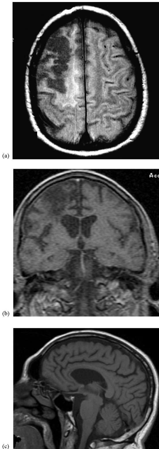
Fig. 1. MR scan: right frontal lesion extending to the lateral premotor cortex.

Result: Lucio's performance was quick and faultless; all objects were correctly named.