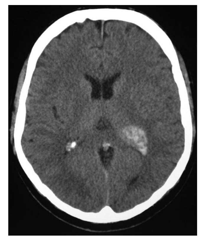
Figure 3. A 57-year-old man presenting with temporal lobe seizure. A pre-contrast CT brain scan shows a well-circum-scribed haemorrhagic mass in the trigone of the left lateral ventricle.