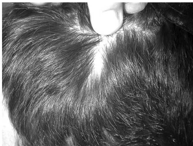
Figure 4. Photograph of the scalp scar with a hairless spot.

living room table before 14 years, which was not treated medically. Examination of the scalp overlying the aneurysms and the site of previous trauma revealed a focal alopecic scar (Fig. 4). Reexamination of the head CT with bone windows, did not reveal any residual bony abnormality.