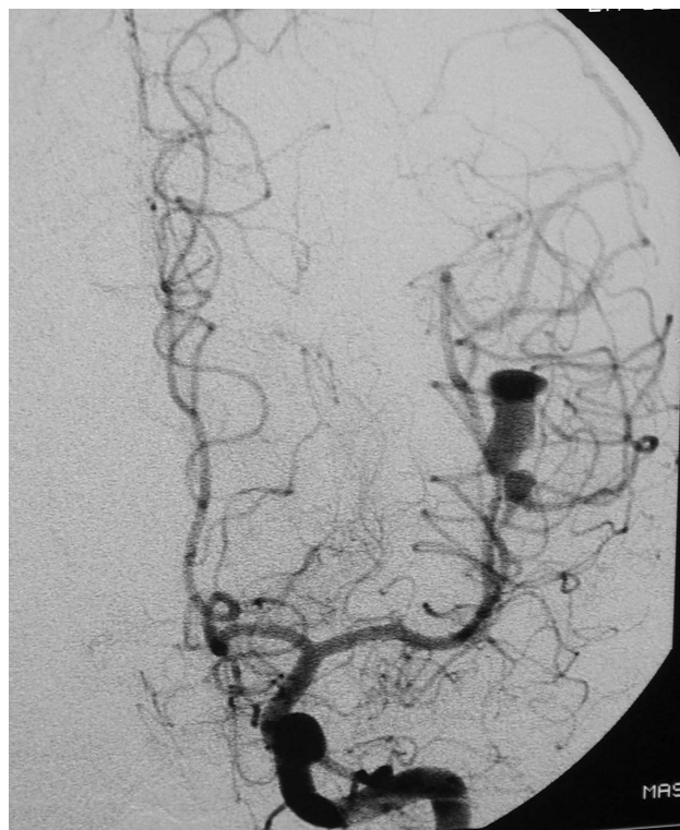
Figure 3. Anteroposterior and lateral left internal carotid angiographic views demonstrate pseudoaneurysms arising from adjacent MCA opercular branches.