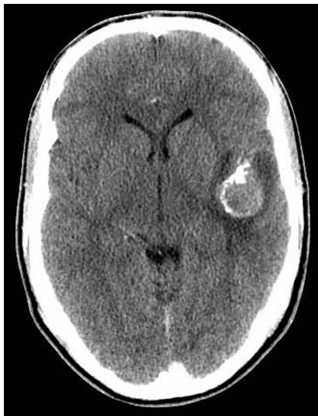
Figure 1. Unenhanced axial brain CT reveals a heterogeneous intraaxial mass effect, with multiple calcified and bleeding foci, surrounded by digitiform edema.

tasks in the last 3 months, which he attributed to excess of work. MRI disclosed an onion-like layered hemorrhagic collection with a dilated branch of the middle cerebral artery anterior to it and with a peripheral rim of enhancement and significant surrounding edema (Fig. 2, A–D). Selective angiography revealed the presence of two adjacent pseudoaneurysms located at the opercular segment of the precentral and angular branches of the middle cerebral artery (Fig. 3, A and B). Both lesions were irregular, without a definite neck, and had contrast media stagnation and showed complete involvement of the parent vessel. The patient underwent neurosurgical aneurysmal trapping. On careful questioning, the patient recalled hitting his left head against the sharp corner of the