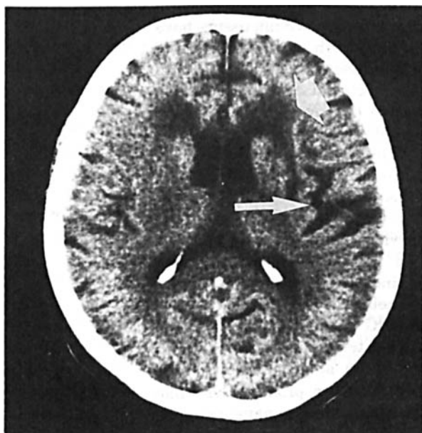
Figure 1. Cranial CT of patient 1: left frontal periventricular infarction (broad arrow), and left fronto-temporal cortical atrophy (slim arrow)

In August 1987 a 57-year-old right-handed woman experienced an ischaemic stroke with right-sided hemiparesis. The cranial computed tomogram (CT) disclosed small infarcts of the left callosomarginal and left medial striate arteries. A short period of depressive mood was noticed. After 3 months of intensive rehabilitation, however, she appeared much improved: she was able to walk with a stick and to take up most of her usual activities. She retained a mild paresis of her right hand and a moderate paresis of her right leg.