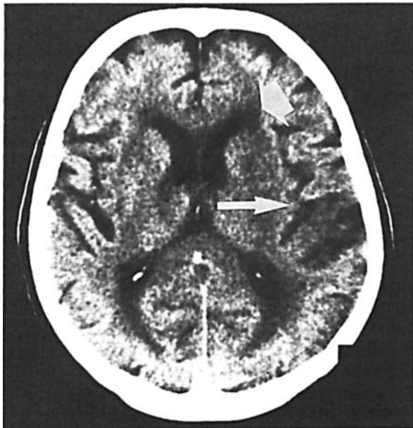
Figure 2. Cranial CT of patient 2: left frontal periventricular hypodensity (broad arrow), and left fronto-temporal cortical atrophy (slim arrow)

going on with her during the previous months. She felt worried and sceptical about her future.