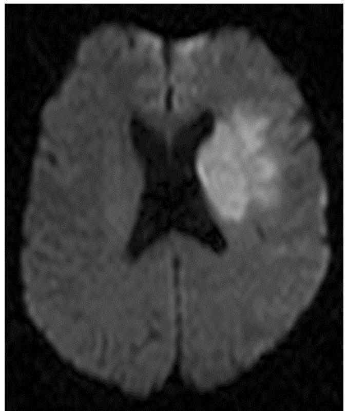
Fig. 2. MRI with ischemic stroke in the territory of the left middle cerebral artery.