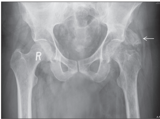
Figure 1) Anteroposterior radiological view of the pelvis performed on September 7, 2007, showing superolateral heterotopic ossification of the left hip joint (arrow)

The initial diagnostic impression was that a right cerebral hemorrhagic stroke had resulted in onset of central poststroke pain, which, in turn, may have distorted and amplified the pre-existing mechanical back pain with pain referral to the hip and groin.