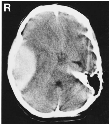
Fig. 1 Computed tomography scan on admission showing an epidural hematoma in the right middle fossa, with marked midline shift.

In our case, head CT had clearly delineated the sinusitis and also the bone defect between the right temporal base and the sphenoid sinus, although we failed to notice these findings preoperatively. The risk is that the dura mater may become progressively stripped from the inner table of