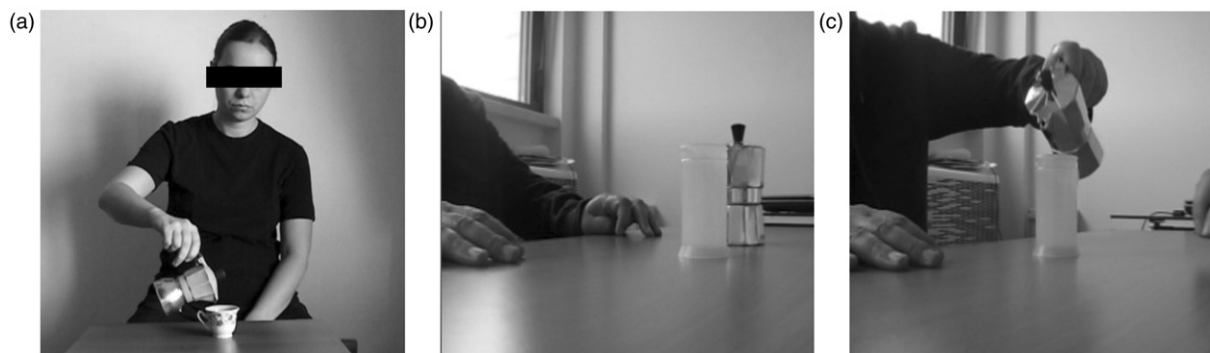
Figure 2. (a) The patient observes very carefully the physical therapist doing a motor act; (b) The patient imagines doing the motor act observed; (c) The patient reproduces the motor act just observed and imagined.