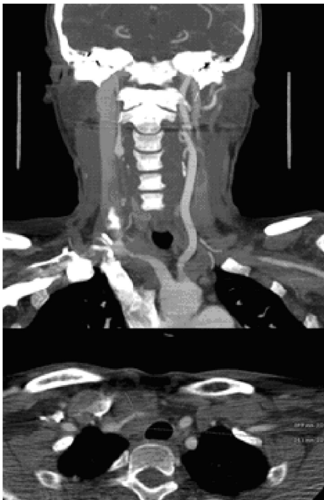
Fig. 1. Tumour around the brachiocephalic artery with severe stenosis of right subclavian artery and completed occlusion of common carotid artery.

fibres of the external elastic lamina. Moderate acute inflammation of the adventitia was seen in the right common carotid, with no signs of infiltration (Fig. 2). These findings were characteristic of GCA and are consistent with the diagnosis of temporal Horton disease or Takayasu arteritis (TA). On the basis of the histological findings, erythrocyte sedimentation rate (ESR), immunological study, syphilis serology, and fludeoxyglucose F18 positron emission tomography (PET) were carried out, all with negative findings. Treatment with oral steroids was initiated. After one year of follow-up, the patient showed no symptoms and treatment continued.