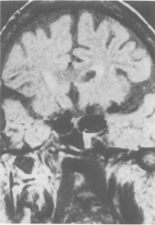
Figure 1 Radiological demonstration of the bilateral intrasellar carotid aneurysms by (a) intravenous contrast enhanced CT scan (axial view of the level of the sellar region); (b) digital venous angiography; (c) MRI: coronal slice (0.5 Tesla; SE, TR 1500 ms, TE 30 ms).

intrasellar carotid aneurysms and pituitary insufficiency. 10,15-20 In contrast to our patient, the clinical symptoms leading to investigation and diagnosis of all these cases were related to the neurological manifestations of basal intracranial aneurysms: severe headache, oculomotor palsies, visual failure, sudden exophthalmos and subarachnoid haemorrhage, while documentation of partial or complete hypopituitarism was a secondary by-product of the complete medical workup of the patients. Our patient had transient diplopia 10 months before admission, but this symptom was not spontaneously reported.