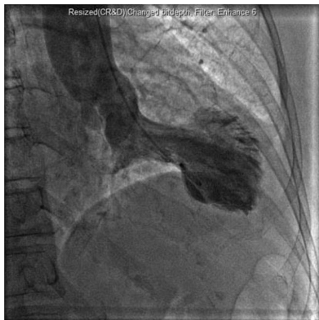
Figure 3. Ventriculogram of a patient with Takotsubo cardiomyopathy during systolic phase.

Takotsubo cardiomyopathy (also known as stress-induced cardiomyopathy, transient apical ballooning, and broken heart syndrome) is a pathological condition of the left ventricular myocardium triggered by intense physical or emotional stress. Takotsubo cardiomyopathy was first described by Sato et al. 25 in 1990 in Hiroshima, Japan. The clinical presentation of Takotsubo cardiomyopathy mimics ACS, and the most common presenting symptom in Takotsubo cardiomyopathy is chest pain, although dyspnea, syncope, and weakness are common. 26 In English the Japanese word "takotsubo" means octopus trap. During the systolic phase of the cardiac cycle, the left ventricle of a patient with Takotsubo cardiomyopathy closely resembles an octopus trap (Figure 3). In Takotsubo cardiomyopathy, left ventriculography or echocardiography reveals apical dyskinesia (ballooning) and compensatory hyperkinesis of the basal wall (Figure 4). There can be no evidence of arterial occlusion or acetylcholine-induced vasospasm. However, transient dyskinesia of the midventric-