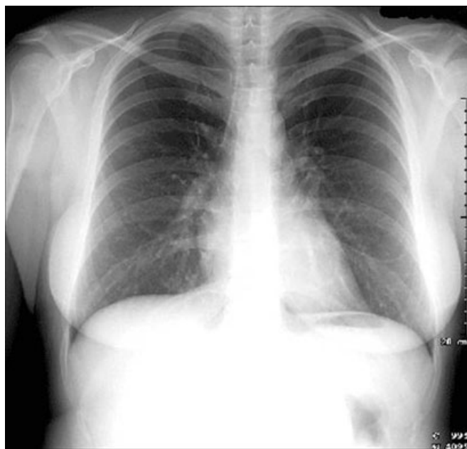
Figure 2. Chest radiograph of our patient.

elderly female presenting with focal neurological deficits that had been present upon awakening. Second, while in the ED, she has ischemic ECG changes in the setting of acute chest pain radiating to her upper back. Third, her examination is notable for dysarthria, left facial droop, and right-sided hemiparesis. She is also noted to have no pulse deficits and equal bilateral blood pressures. Finally, the rest of her diagnostic work-up, which included a noncontrast brain CT scan, chest radiograph, and laboratory work, are all essentially normal.