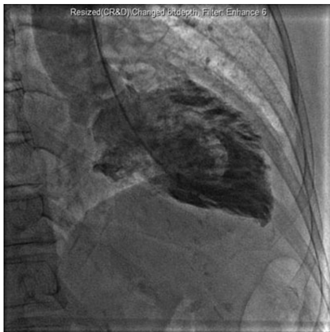
Figure 4. Ventriculogram reveals apical ballooning observed in Takotsubo cardiomyopathy.

ular portion of the left ventricle rather than the apex is seen in a minority of patients with Takotsubo cardiomyopathy. 22 Usually, the troponin, CK, and CK-MB fractions are mildly elevated but will not reach the levels seen in a STEMI. 26 The cardiac markers may also remain normal for the course of the illness.