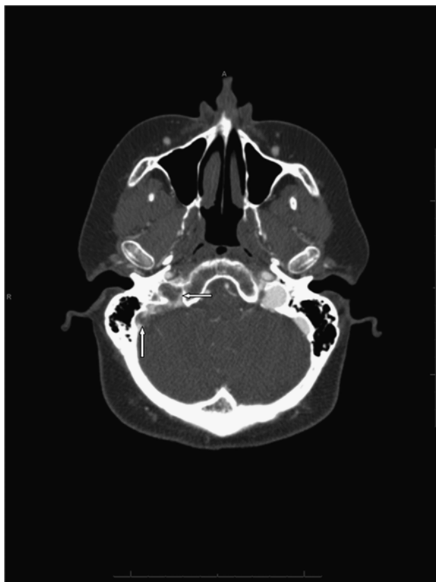
FIGURE 3. Computed tomographic venography at the skull base showing low-density thrombus within the right sigmoid sinus and jugular bulb (arrows).

cerebral venous sinus thrombosis, including somnolence, bradyphrenia, or apathia and hallucinations and memory loss. The single patient with hallucinations had associated bilateral thalamic edema. None of the 6 patients described had temporal lobe involvement, as our patient did. The transverse gyrus of Heschl in the dominant hemisphere, matching the location of primary auditory cortex, has been implicated in auditory verbal hallucinations. 6 There may also be a role of the right (nondominant) hemisphere in auditory hallucinations. 7,8 One study implicated the medial temporal gyrus in auditory hallucinations in schizophrenia. Cortical activation of the right middle temporal gyrus on functional MRI was reduced during periods of increased auditory