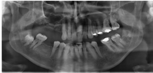
Fig. 1. Orthopantomogram revealing caries profunda in multiple teeth and severe periodontal break down.