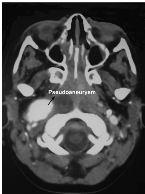
FIGURE 1. Contrast-enhanced CT scan axial section at the level of the oropharynx demonstrates an ovoid enhancing right parapharyngeal mass. This is situated at the anatomical position of the ICA and was consistent with an ICA pseudoaneurysm.

intact cerebral circulation via the circle of Willis. After the procedure, the patient was administered enoxaparin for 72 hours, followed by a long-term acetylsalicylic acid.