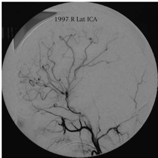
Digital subtraction angiography of the right internal carotid artery demonstrates characteristic moyamoya appearance of the cerebral vasculature.

weakness was noted. Her deep tendon reflexes were normal and symmetric.