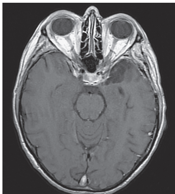
Figure 3 Postoperative MRI 4 months after surgery: T1-weighted sequence after gadolinium injection, showing complete resection of the meningioma.

To our knowledge, this is the first reported case where endovascular angioplasty of intracranial ICA and MCA stenosis, related to tumor compression, has been used to help the tumor resection. Several techniques are routinely proposed to treat atherosclerotic stenosis of the intracranial ICA or its branches, including angioplasty, stenting and extra-intracranial arterial bypass, but few reports concerned the treatment of vascular stenosis related to tumor compression. Heye et al. 5 reported a case of stenosis of the intracavernous segment of the ICA, due to a meningioma, treated by endovascular stent placement. In this case, a stent was