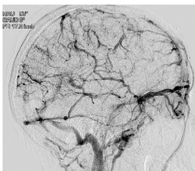
Figure 2. Lateral digital subtraction angiogram illustrating thrombosis of the posterior superior sagittal and proximal transverse sinuses. Note delayed contrast filling of multiple cortical veins consistent with venous hypertension.

(Terumo, Somerset, New Jersey, USA) into the left transverse sinus. A Cook exchange-length wire (Bloomington, Indiana, USA) was then navigated into the left transverse sinus, and the 5-Fr guide catheter was exchanged for a 6-Fr Terumo destination sheath (Somerset, New Jersey, USA). The 0.054-inch Penumbra thromboaspiration catheter was then navigated over an Agility 14 microwire (Cordis Neurovascular, Miami, Florida, USA) through the thrombus