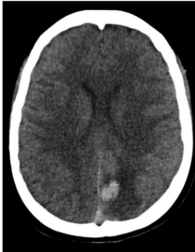
Figure 1. Noncontrasted head CT obtained following the patient's rapid neurological decline revealing hemorrhagic conversion of a venous infarction involving the left parieto-occipital region. Note the persistent hyperdense thrombus in the posterior superior sagittal sinus (SSS) despite systemic heparinization. A small right orbitofrontal hemorrhagic venous infarction was observed on a higher axial cut (not pictured).

(Terumo, Somerset, New Jersey, USA) into the left transverse sinus. A Cook exchange-length wire (Bloomington, Indiana, USA) was then navigated into the left transverse sinus, and the 5-Fr guide catheter was exchanged for a 6-Fr Terumo destination sheath (Somerset, New Jersey, USA). The 0.054-inch Penumbra thromboaspiration catheter was then navigated over an Agility 14 microwire (Cordis Neurovascular, Miami, Florida, USA) through the thrombus