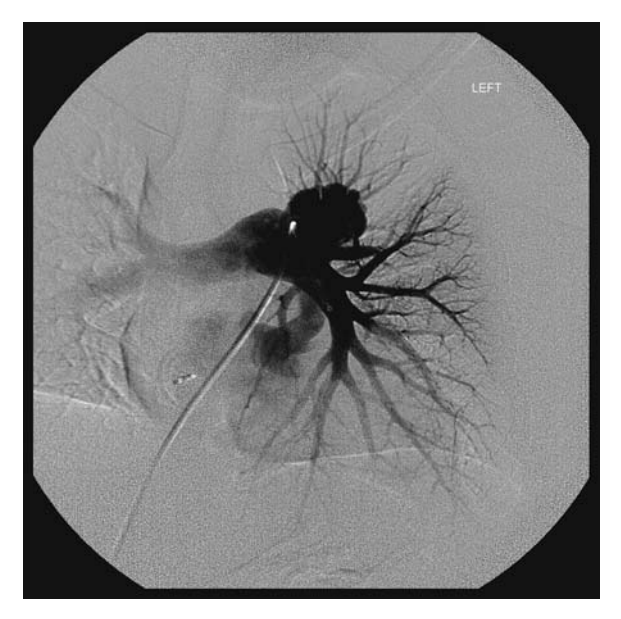
FIGURE 3. Pulmonary arterial angiography. A large arteriovenous malformation is shown.

is the highest in the third trimester and immediately postpartum, but an increased risk of venous thromboembolism is clearly present from the first trimester.<sup>1</sup> The incidence of stroke during pregnancy has been estimated to be 5 to 15 per 100,000. A significant portion of the strokes occur later in pregnancy, with the highest occurrence around the third trimester and immediately postpartum.<sup>4</sup> Nearly 5% of maternal deaths are the result of stroke and approximately half of pregnancy-associated stroke survivors have residual neurological deficits.<sup>5</sup> Fetal complications from maternal stroke include premature delivery and death. Thus, treatment and prevention of stroke in pregnancy may have a significant impact on the morbidity of both the mother and fetus.