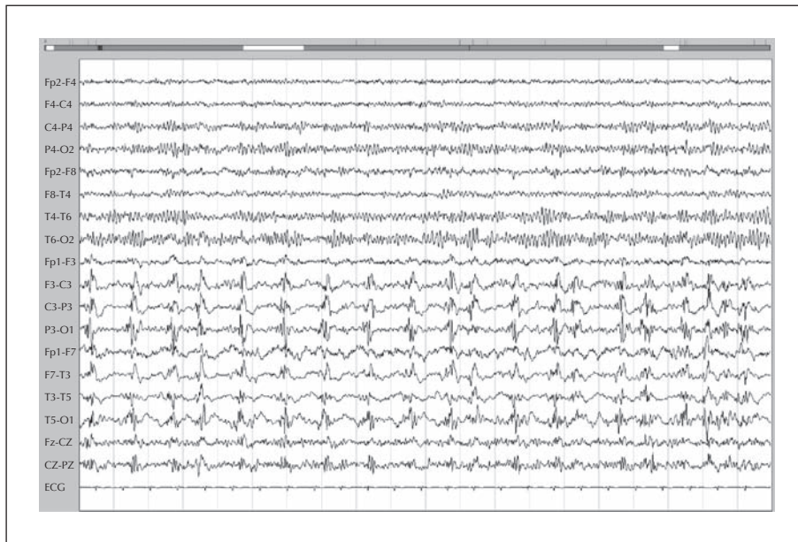
Figure 2. Third day after stent placement. Continuous spike and polyspike-wave discharges occurring in a pseudoperiodic fashion over the left hemisphere with maximal amplitude in parietal and temporal regions. Background activity is normal in the right hemisphere.