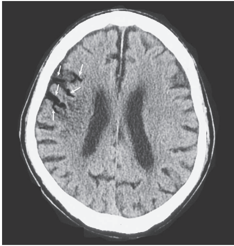
Figure 1. Initial head CT at 20 min after symptom onset shows multiple air densities (white arrow) within the right middle cerebral artery (MCA) territory, but not in the left hemisphere and the posterior circulation territory.