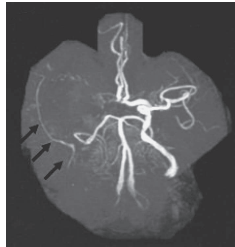
Figure 4. MRA showed occluded right internal carotid artery (ICA).

hours later. We performed lower extremity venous ultrasound and we could not find any venous thrombosis before the onset of air embolism. Transthoracic echocardiography with the contrast echo method revealed massive influx of microbubbles into the left atrium immediately after the injection of saline containing microbubbles, indicating that he had a large intracardiac RL shunt (Fig. 2). A central venous line in the right internal jugular vein was the only intravascular catheter at the onset of symptoms. On day 12, acute cerebral infarctions in the right MCA territory were observed by diffusion weighted image and fluid attenuation inversion recovery image (Flair) of magnetic resonance imaging (MRI) (Fig. 3). MRA showed occluded right internal carotid artery (ICA) and collateral vascular signals (Fig. 4). We administered glycerol (2) and free radical scavenger, edaravone (3), for the treatment of the cerebral infarction.