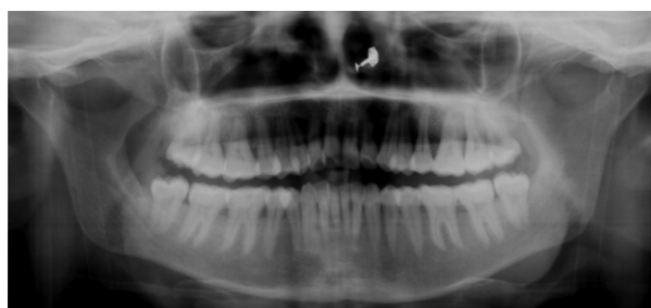
Fig. 2. Orthopantomogram showing bone resorption distal to the right mandibular third molar and anterior border of ramus.

erythrocyte sedimentation rate, C-reactive protein level, and arterial wall edema in the computed tomography angiogram. Blood and radiographic investigations were also performed. A complete blood count revealed low hemoglobin and leukocytosis with increased polymorphs. Orthopantomogram showed bone resorption distal to the right mandibular third molar, also involving a part of the anterior border of ramus (Figure 2).