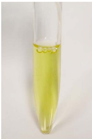
Fig. 1 Photograph of the viscous and xanthochromic cerebrospinal fluid (CSF) obtained from the lumbar puncture. CSF protein, glucose, adenosine deaminase, and cell count were within normal limits and CSF Gram stain was negative.

The patient presented at our institution at age 66 years with a 4-month history of gait disturbance and numbness in the lower extremities. On admission, the manual muscle test in the lower extremities demonstrated antigravity strength proximally and 4/5th of antigravity strength distally. However, tone was increased in the bilateral lower extremities. Sensory examination demonstrated pinprick hypesthesia at T10 on the left and T6 on the right, and abnormal sensation with pain on the foot. The patient also complained of gradual worsening of bladder function, with occasional episodes of urinary incontinence. Preoperative examination included lumbar puncture, which