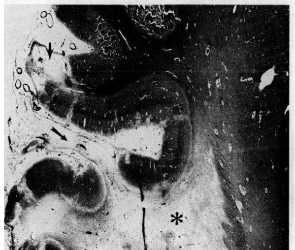
FIG. 3. Section of the calcarine fissure shows prominent infarction of the inferior bank (long arrow) and only minimal affection of the superior bank (short arrow). Subcortical loss of myelin produces conspicuous pallor around the area of infarction(*).

quently, its management. In a study of 104 cases of isolated anopsias, 12 Trobe et al found that 86% of the cases were due to infarction in the posterior cerebral artery territory. Of these, only 16% had homonymous quadrantanopsias. Unfortunately, no correlation with the location of the lesions producing the quadrantic defects was established.