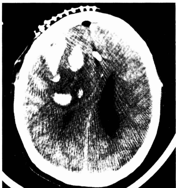
FIG. 2. CT scan 36 hours after surgery shows a hemorrhagic infarct involving the right frontal and parietal lobes.