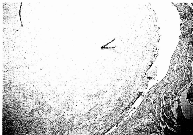
FIG. 4. Complete occlusion of the sagittal sinus by a fresh thrombus (hematoxylin and eosin, \times 100 ).

(9), in a series of 25 patients operated on by this approach, had two patients in whom cortical vein thrombosis and cerebral infarcts developed. They believed the venous and sagittal sinus thrombosis was related to undue pressure by the brain retractor against the sagittal sinus in one patient and to coagulation of two prominent parasagittal veins in the other. In our patient, no retractors were used against the sagittal sinus or the falx; therefore, we cannot postulate this mechanism as the cause of the sinus thrombosis. The surgical coagulation of a prominent draining vein in the parasagittal area was probably the leading factor, since the decreased blood flow throughout the cortical veins and sagittal sinus after