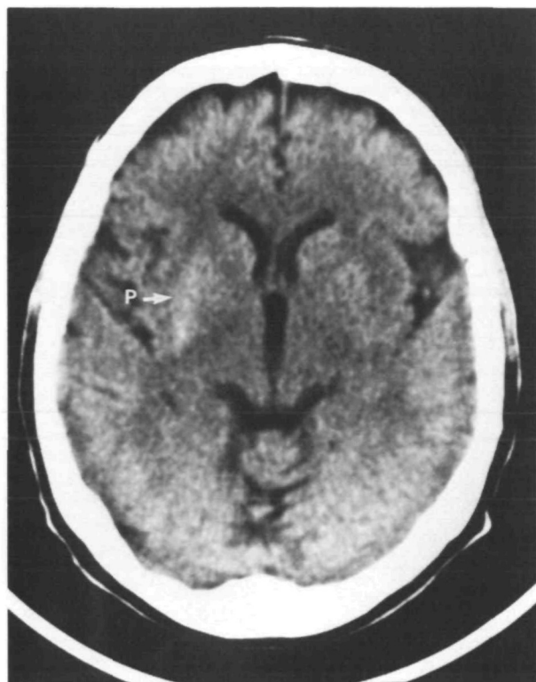
FIGURE 1. Unenhanced admission axial computed tomography through the basal ganglia.