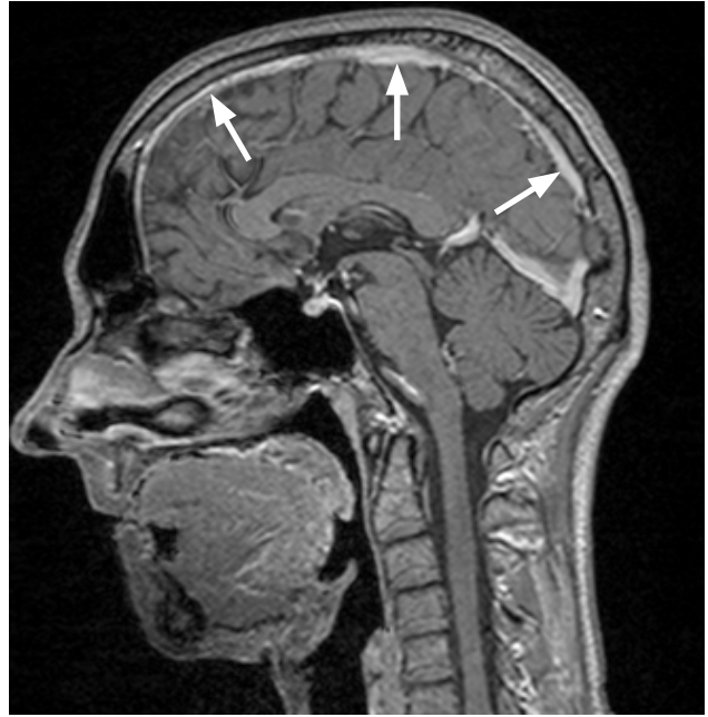
Fig. 2. MRI scan of the brain (T1 weighted sequence): diffuse meningopathy.

Following these neurological findings, further examination focused on neurosarcodiosis, so the patient was hospitalized at the Neurology Department of the Health Care Centre Valjevo for the second time. Laboratory tests yielded: white blood cells count - 11.300/mm3, ACE in serum and CSF were 71.5 U/L and 2.0 U/L (0-0), respectively. CSF analysis indicated lymphocytic pleocytosis (10 cells), raised protein level (0.77g/L), hypoglycorrhachia (2.3 mmol/L) and the presence of 9 oligoclonal IgG bands detected by CSF electrophoresis. Cultures for my-