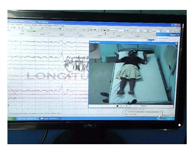
Video 2 Video-EEG demonstrating ictal discharges in right temporal area.

patients of hypoxic–ischaemic encephalopathy develop epilepsy at the age of 3.5 years. Only some patients develop epilepsy after this age.<sup>5</sup> In a population-based epidemiological study in children from Brazil, the authors found that symptomatic focal epilepsy was the most common epileptic disorder and hypoxic–ischaemic encephalopathy as its leading aetiological factor.<sup>6</sup> Our patient presented with reflex seizures after a gap of 10 years of perinatal insult. Reflex epilepsy is an epileptic disorder characterised by provoked seizures due to external stimulus and sometimes due to internal mental mechanism. Various reflex stimuli mentioned in the literature are visual, auditory, olfactory, somatosensory, vestibular, reading, music, internal thoughts and hot water baths.<sup>7</sup> A case was reported on somatosensory rub-evoked epilepsy originating from the temporal lobe. In this study, the authors described a patient developing seizures evoked by a touch or rub on the