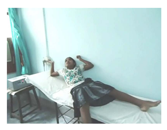
Video 1 Video of the patient exhibiting tap induced gelastic dacrystic seizure.

Initial treatment was phenobarbitone (60 mg/day) prescribed by the physician. She poorly responded to therapy. She was then prescribed a combination of sodium valproate (500 mg twice a day) and