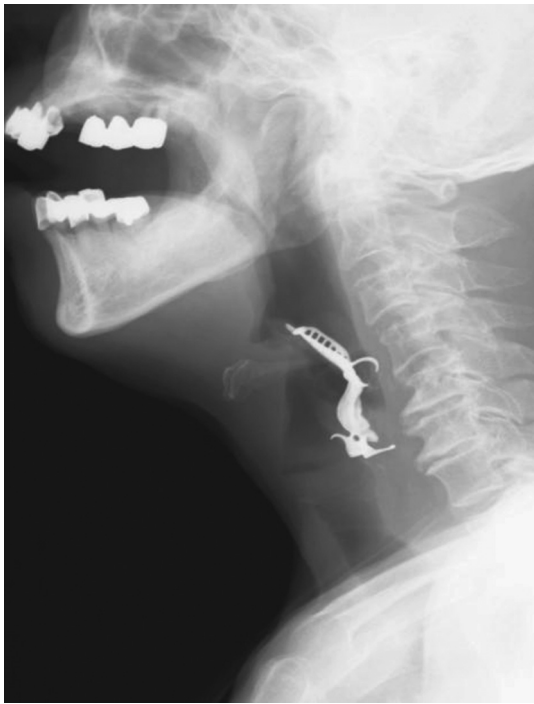
FIGURE 2 Neck x-ray demonstrates radiopaque dental prosthesis in the hypopharynx.

rehabilitation for the left hemiplegia, and after discharge from the hospital, he continued to visit the outpatient department.