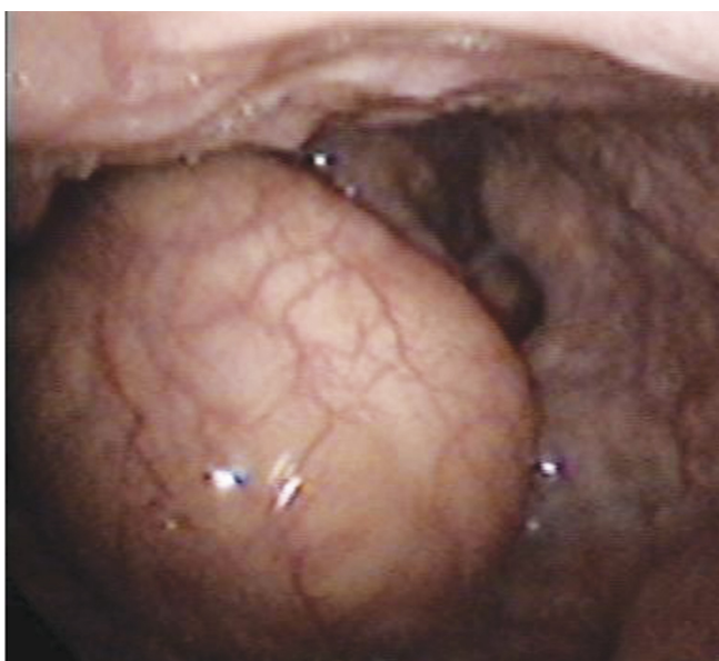
FIGURE 1 Fiberoptic endoscopic view of the epiglottic cyst ( 2.7 \times 3.0 \times 2.3 cm).