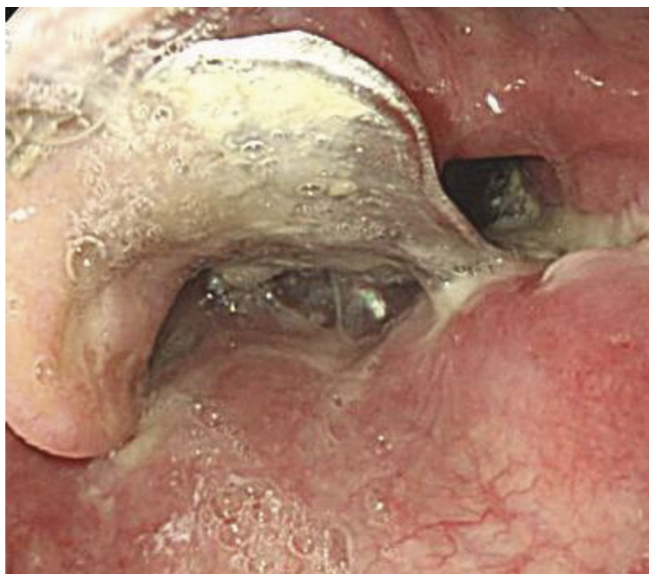
FIGURE 3 Endoscopic examination reveals the dental prosthesis across the hypopharynx.

However, as in this case, other etiologies besides the brain lesion itself, such as stricture, tumor, foreign bodies, and systemic illness such as Parkinson disease, must not be overlooked. Stroke