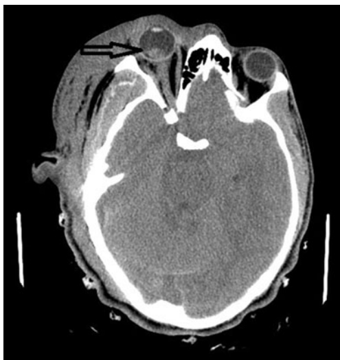
Fig. 3 Axial noncontrast CT image demonstrates worsening intraocular hemorrhage in conjunction with partially visualized worsening global cerebral edema and subarachnoid and subdural hemorrhage

bilaterality observed in 43–67 % of cases [1–6]. In a recent large prospective series from 2008, Fountas et al. found Terson hemorrhage in 12.1 % of their 174 postaneurysmal subarachnoid hemorrhage patients [1].