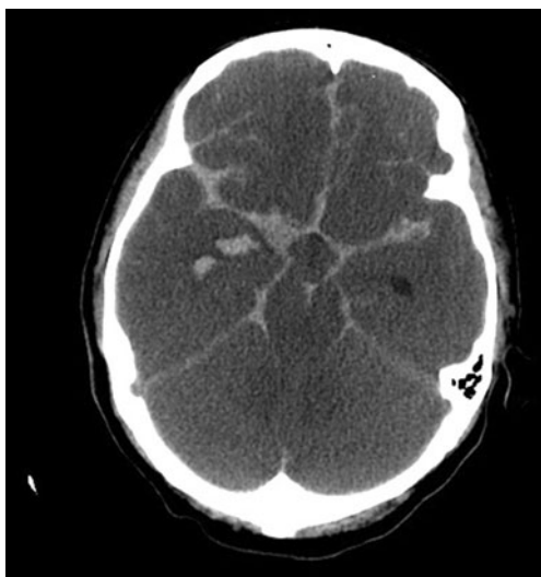
Fig. 4 Axial noncontrast CT image demonstrates diffuse subarachnoid hemorrhage in the basilar cisterns and overlying the frontal and temporal lobes, global cerebral edema and a small focus of intraparenchymal blood partially visualized at the level of the medial right temporal lobe

Though the gold standard for detection is fundoscopic exam, imaging is not insensitive. In a retrospective series of 12 patients diagnosed clinically with Terson syndrome, Swallow et al. found that CT imaging had a sensitivity rate of 66 % for the detection of hemorrhage [7]. Positive findings included hyperdense thickening and nodularity of the retinal surface overlying the optic disk. Remote differential diagnostic considerations as such would include melanoma or orbital metastases, though in the acute clinical setting, the