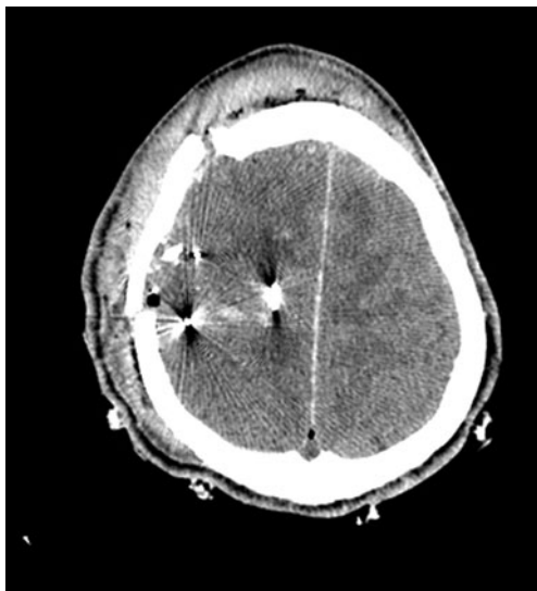
Fig. 1 Axial noncontrast CT image demonstrates numerous ballistic and bone fragments with accompanying intra- and extra-axial hemorrhage and edema at the level of the right frontal and parietal lobes. An overlying calvarial fracture and extensive scalp swelling is also noted

Our second patient, a 50-year-old female, had a prolonged medical history notable for hepatitis C-induced cirrhosis and hepatocellular carcinoma. Immediately prior to the terminal ictus event, she had undergone scheduled admission to the transplant service for radio-frequency ablation of the hepatic tumor. The procedure was uneventful and well tolerated. While recovering from the event on the ward, on postoperative day 1, the patient became abruptly nonresponsive and collapsed. Following resuscitation efforts, an emergent head CT demonstrated diffuse subarachnoid hemorrhage with intraventricular extension, generalized cerebral edema, and early hydrocephalus (Fig. 4). Additionally, a small focus of intraparenchymal hemorrhage was observed in the medial right temporal lobe adjacent to the anterior aspect of the right temporal horn, with a distribution and appearance favoring potential dissection from a rupture of posterior communicating aneurysm. Extracranial findings