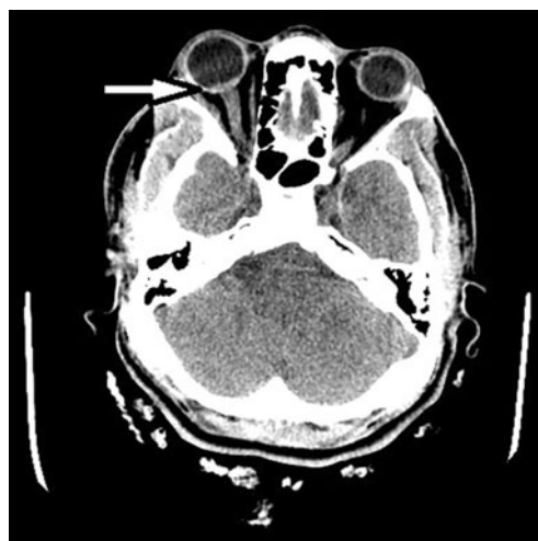
Fig. 2 Axial noncontrast CT image demonstrates faint linear hyperdensity at the level of the posterior chamber of the right globe compatible with Terson hemorrhage dissecting in a subhyaloid fashion over the optic disk. Similar changes were seen in the left globe (not shown)

were notable for bilateral subarachnoid extension of hemorrhage along the optic nerve sheaths, with subhyaloid posterior chamber hemorrhage compatible with accompanying Terson syndrome (Fig. 5). A CT angiogram of the head was attempted as well, though proved to be nondiagnostic, with stasis of contrast at the level of the distal extracranial carotid and vertebral vessels due to markedly elevated intracranial pressure, exceeding the cerebral perfusion pressure. Following the pronouncement of brain death and withdrawal of supportive measures, the patient expired shortly thereafter.