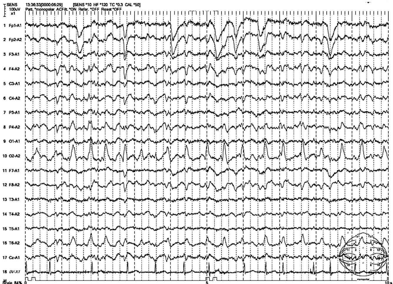
Fig. 2. EEG on admission. EEG shows periodic lateralized epileptiform discharges in the right temporo-occipital lobe.

inhibiting visual pathway, both resulting in generating discharges falsely interpreted as due to sensory inputs. However, the mechanisms of complex visual hallucinations in patients with a visual field defect due to intracranial diseases are still controversial, 1 probably because patients having intracranial lesions are prone to develop symptomatic epilepsy compared to those with a visual field loss from disorders in the extracranial optical tract. In the present case, SPECT showed hyperperfusion related to repetitive ictal sharp wave discharges seen over temporo-occipital leads in EEG. The history of a delay of over one year between the occurrence of visual hallucinations and intracerebral bleeding, as well as the short duration of the visual phenomena, support an epileptic origin rather than a release phenomenon as the probable