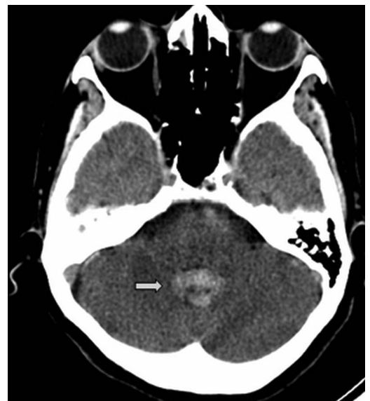
Figure 1 Cranial CT scan showing a well-defined hyperdensity in vermis (arrow), suggestive of intraparenchymal haemorrhage.

Doppler ultrasonography of the extracranial carotid and vertebral arteries showed arteriosclerotic lesions but no haemodynamically significant occlusion. Routine laboratory tests revealed random blood glucose of 162 mg/dL; however, subsequent values and glycated haemoglobin were normal. Complete blood counts, erythrocyte