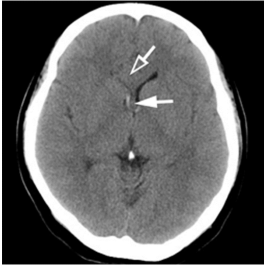
Fig. 1. A CT scan at admission (17 weeks of gestation) showed a small hemorrhage along the margin of the right lateral ventricle (solid arrow) and a space-occupying lesion displacing the right frontal horn of the lateral ventricle posteriorly (open arrow).

year earlier, she had a full-term pregnancy and uneventful vaginal delivery. The initial neurological examination showed a consciousness level of E4V5M6 (Glasgow Coma Scale) with both pupils equal in size and no focal neurological deficit. Her vital signs were: blood pressure 128/78 mmHg, pulse 96 beats/min, body temperature 37.1 °C, and percutaneous oxygen saturation (SpO 2 ) 98% (room air). Computed tomography revealed a right small ICH with rupture into the right lateral and third cerebral ventricles and an unknown space-occupying lesion displacing the right frontal horn of the lateral ventricle posteriorly (Fig. 1). Brain magnetic resonance imaging (MRI) revealed an AVM encroaching on the right cingulate gyrus and corpus callosum (Fig. 2A). Based on the size of the malformation (2.5 cm), its location in an eloquent area, and the presence of deep venous drainage delineated as a flow void by magnetic resonance angiography, we made a clinical diagnosis of a Spetzler–Martin Grade III AVM.