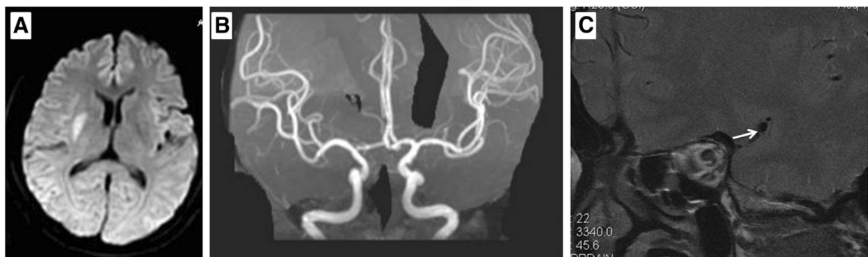
Figure 2 MRI, MRA and HR MRI findings of Case 2. (A) MRI diffusion weighted image shows a hypersensitive lesion on posterior limb of internal capsular. (B) MR angiography of the MCA is normal. (C) High-resolution MRI of MCA indicates the presence of an atherosclerotic plaque on the frontal wall of the right proximal MCA.

This is the first study to date on HR MRI findings of MCA cross-section in patients with CWS. Capsular infarctions were demonstrated in the territory of a lenticulostriate artery on DWI in both 2 patients. Although cerebral vascular angiography showed no abnormalities, HR MRI disclosed atherosclerotic plaques on the ventral