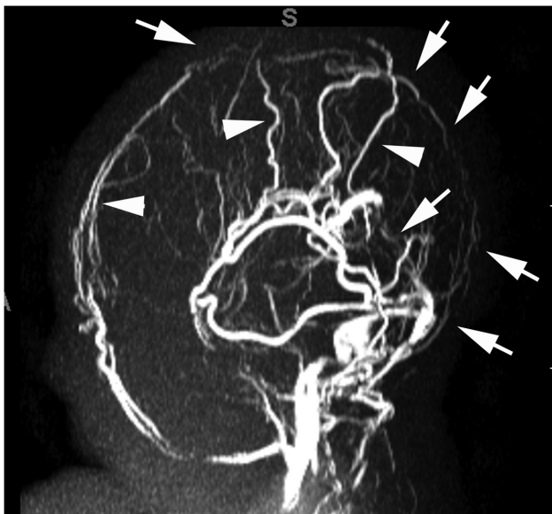
Figure 1 Sagittal view of an MR venography minimum intensity projection (MIP) image showing thrombosis of the superficial and deep dural venous sinuses (arrows) and collateral veins (arrowheads).

Due to the focal onset of secondary generalized seizures, phenytoin was initiated, and then as the seizures continued phenobarbital was added. In brain computed tomography scan, an image with increased density in the straight sinus, which might be consistent with thrombosis, was detected, and brain magnetic resonance imaging (MRI) revealed signs of diffusion limitation and ischemia. In the MRI venography, the patient had thrombosis in the superior sagittal sinus, right lateral sinus and sinus rectus with normal and patent cerebral arteries (Figure 1). In the electroencephalography (EEG), frequent and asynchronous sharp and spike wave discharges, which were originating from different