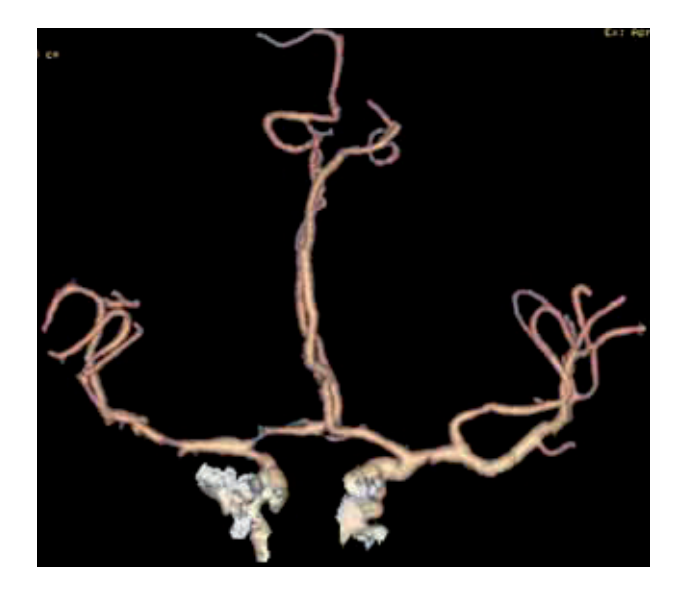
Figure 4 Arterial angiographic CT study. Stenosis of right middle cerebral artery and narrowing of ipsilateral anterior cerebral artery.