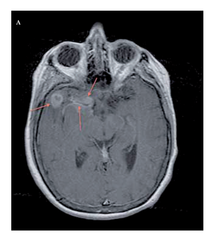
Figure 3 MR, 3D T1 TFE post-gadolinium. A) Heterogeneous enhancement in the right anterior temporal lobe (ring-like laterally and more diffuse on the mesial portion) and enhancement of the wall of the right middle cerebral artery. B) Focal superficial enhancement in the left insular region.

Figure 2 MR, Ax T2 TSE. Cyst-like lesion in the right lateral anterior temporal lobe, and expansion and slight hyperintensity on right temporal mesial structures.