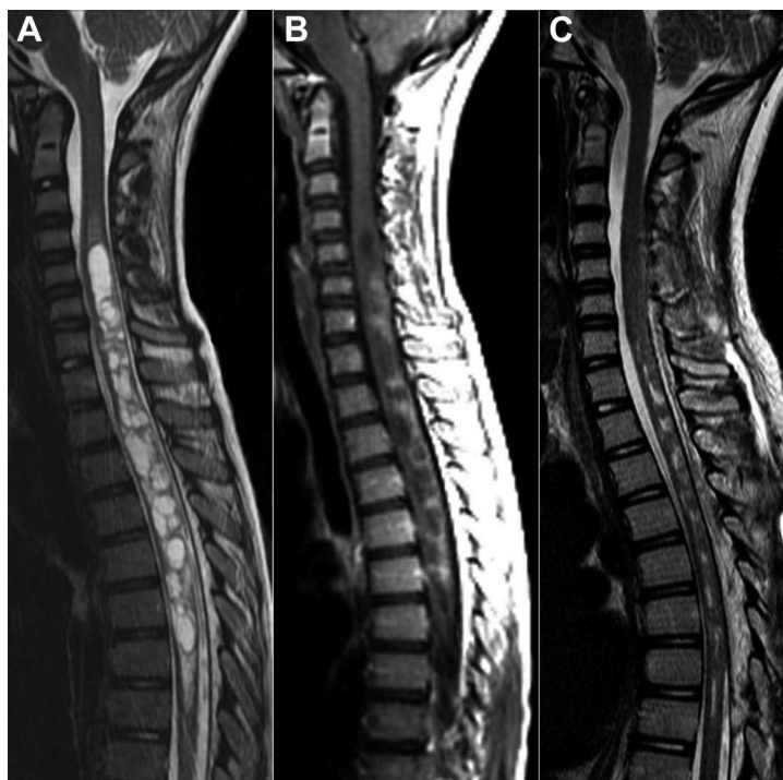
Figure 1 Baseline and repeat spinal cord MRI after immunotherapy

Sagittal T2-weighted MRI demonstrates a large multiloculated cystic lesion within the spinal cord extending from C4 to T7 (A), with patchy peripheral nodular enhancement on postcontrast scan (B). (C) Decreased axial extension of the lesion and improvement in spinal cord edema and expansion 4 weeks after steroid therapy.