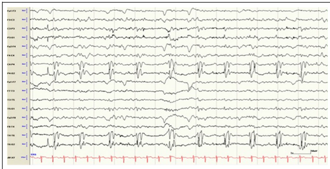
Figure 1. Standard EEG recording in a bipolar montage demonstrating right occipital periodic lateralized epileptiform discharges associated with occasional visual phenomenon in patient 3.

unremarkable. The last stroke that year was associated with a clinical event characterized by retained consciousness, diffuse shaking, and horizontal headshaking. The patient was subsequently found to have a homonymous hemianopia, and an acute metabolic stroke was identified in the contralateral posterior cerebral artery territory on MRI.