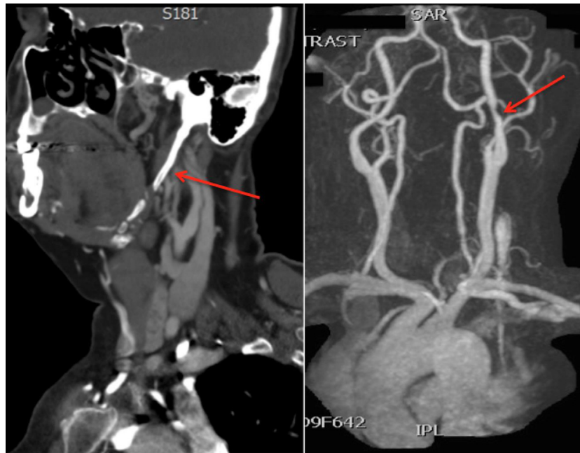
Fig 1. Sagittal reconstruction view ( left ) and global reconstruction view ( right ). The arrows point to the elongated styloid process ( left ) and stenosis of the internal carotid artery ( right ).