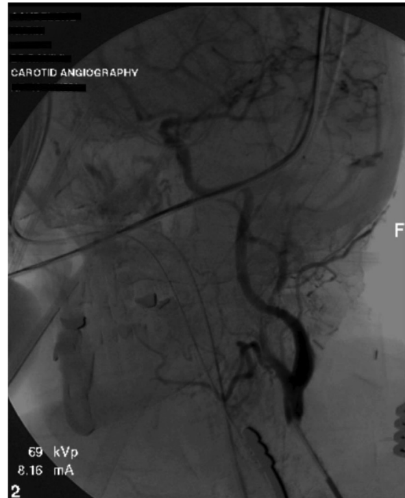
Fig 3. On-table completion angiogram after removal of the styloid process.

is a shorter procedure, will avoid external scarring, and has less risk for facial nerve injury. The extraoral approach, however, described by Loeser and Caldwell as early as 1942, offers a better view of the surgical field, affords