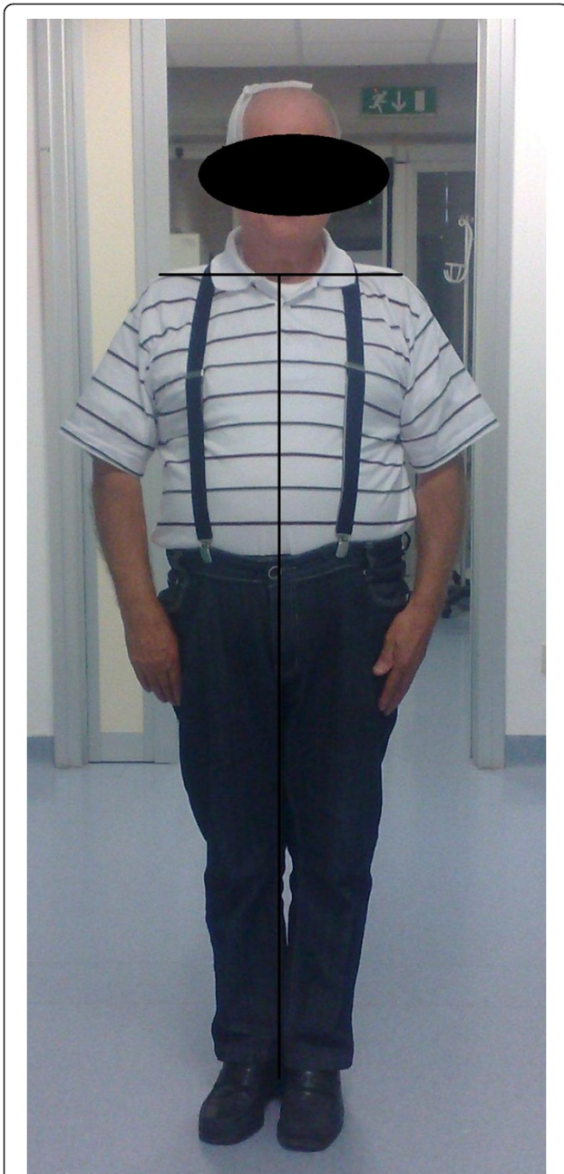
Figure 3 Patient in standing position after intervention.

Four days after haematoma evacuation, both tonic trunk flexion and weakness in left upper limb dramatically improved until complete resolution. The patient maintained adequate standing position and did not swerve to the left during walking.