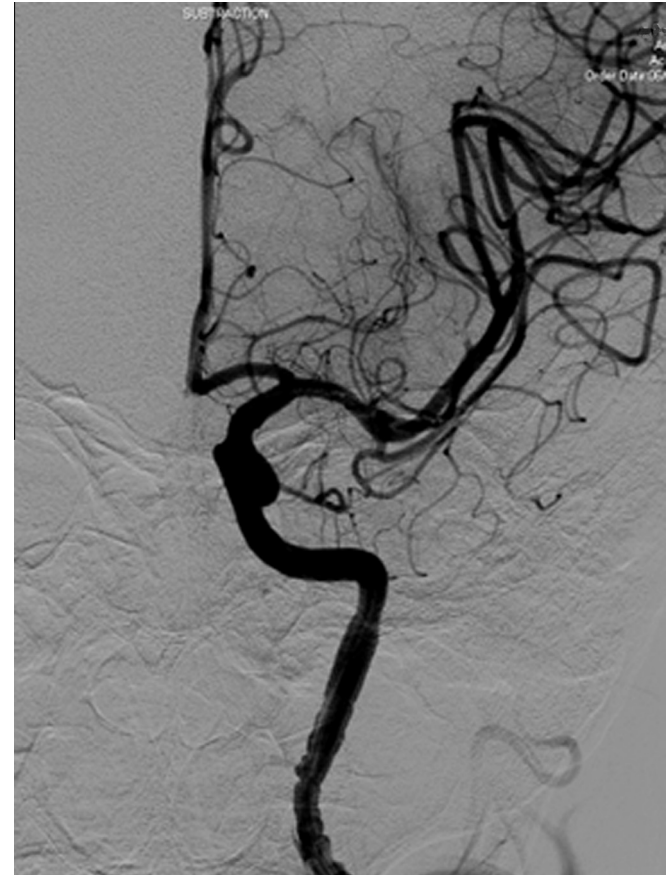
Fig. 2. The distal internal carotid artery was rapidly recanalized with a standard stent-based thrombectomy procedure. Immediately afterwards, angioplasty was performed in the fibromuscular dysplasia segment before stent implantation.

continued on aspirin and clopidogrel therapy, and made a rapid and uneventful neurological recovery. She was discharged home after 7 days with only mild residual right arm paresis. At 90 days, the patient achieved complete neurological recovery (modified Rankin Scale score 0).