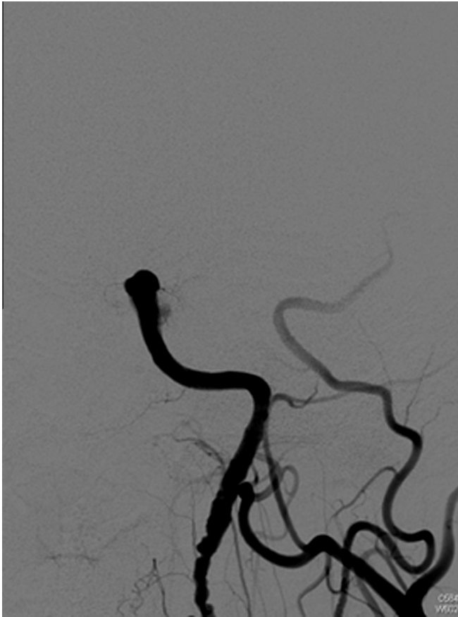
Fig. 1. Selective angiogram of the left common carotid artery showing complete “T” occlusion of the distal left internal carotid artery and demonstrating the characteristic “string of beads” pattern, preceded by a tapered luminal stenosis, associated with fibromuscular dysplasia. There are no signs of an associated dissection.