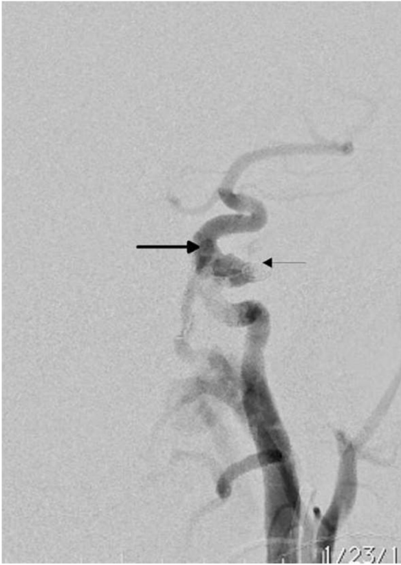
Figure 5. Image after the coiling procedure. A left internal carotid artery cerebral angiogram with traditional angles and magnification showed a complete absence of the previously seen retrograde filling of enlarged left cortical vein and absence of the previously seen retrograde filling of pial venous structures on the cortical surface. The internal carotid artery is at the large arrow and coil at the small arrow.

This case is notable because the patient presented to the ED months after the initial head injury with acute onset of symptoms that were consistent with a lesion in middle cerebral artery distribution. Because the patient's focal neurologic deficit symptoms improved with the initiation of levetiracetam therapy and then had nearly completely resolved after surgical management of the fistula, we concluded that his stroke-like presentation was actually a seizure manifestation. In fact, the EEG that showed focal activity arising from the left frontal region highly suggested a seizure disorder. However, other possible causes of the seizure manifestation included venous congestion, a steal phenomenon from the ICA due to the CCF, or even a combination of underlying pathologic changes that were all secondary to the original head injury.