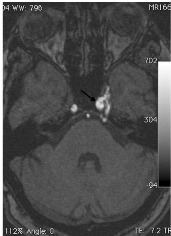
Figure 3. Magnetic resonance angiogram of the brain shows an arteriovenous fistula (arrow) arising from the anterolateral aspect of the precavernous left internal carotid artery, directly communicating with adjacent cortical veins.

The patient then underwent an intracranial Codman coil embolization of the left carotid cavernous fistula. Postembolization left internal carotid artery cerebral angiogram was performed, showing a complete absence of the previously seen retrograde filling of the enlarged left cortical vein and absence of retrograde filling of pial venous structures on the cortical surface (Figure 5). No complications occurred during or after the coiling procedure. The patient was discharged after a 10-day hospital stay in stable condition, and he was instructed to follow up with Neurosurgery.