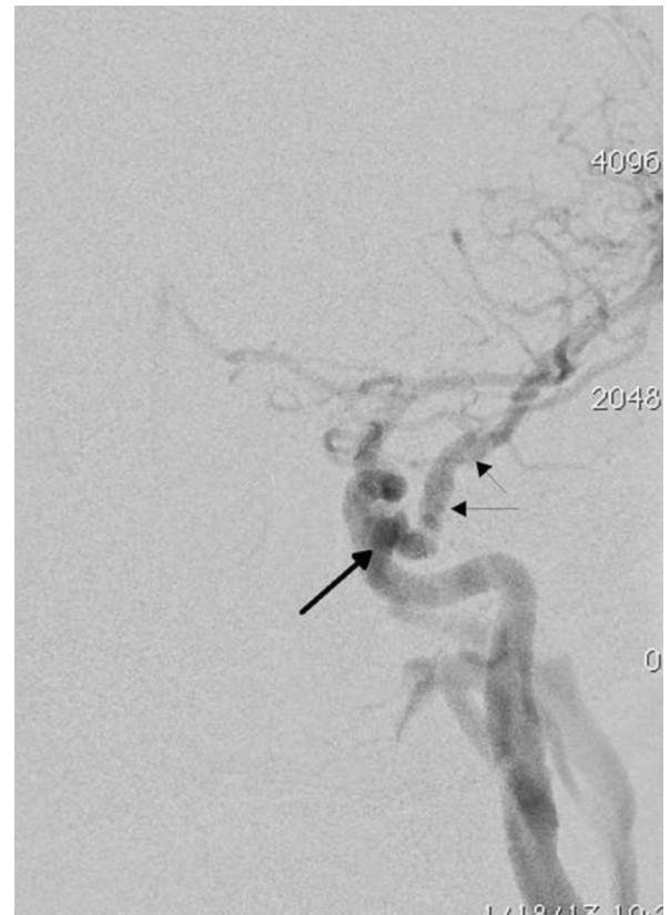
Figure 4. Brain arteriogram prior to coil. Direct carotid cavernous fistula between the left internal carotid artery cavernous section and the left cavernous sinus. The major drainage is through an enlarged inferior petrosal sinus as well as retrograde filling of a significantly enlarged left cortical vein. Large arrow is on the fistula and the small arrows are on a huge cortical vein.

The estimated incidence of traumatic brain injury (TBI) in the United States is 1.5 million per year. Approximately 0.2–0.3% of these TBIs are complicated by CCF (2,3). Barrow et al. classified CCF into direct/Type A and Indirect (Types B, C, D) (1). Direct CCF, which most commonly occurs in TBI patients, is a high-flow fistula that develops between the internal carotid artery and cavernous sinus (4,5). Symptomatic direct CCF may be caused by any severity and a wide variety of traumatic