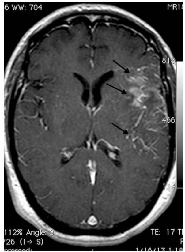
Figure 2. Magnetic resonance imaging (MRI) study of the brain shows abnormal enhancement as well as fluid-attenuated inversion recovery (FLAIR) hyperintensity in the inferior aspect of the left frontal lobe extending to the anterior aspect of the left temporal lobe in the left periventricular white matter (arrows). This involves the insular and subinsular regions. Multiple linear areas of enhancement are seen in an area of FLAIR hyperintensity, which appear to be vessels and veins with more matted enhancement involving the left insula.

opercular region, the left insula, and subinsular tracks. The left ICA appeared to be significantly larger than the right ICA, which could be attributed to turbulent flow at the level of the carotid bulb. An electroencephalogram (EEG) demonstrated electrographic focal seizures arising from the left frontal region, likely reflective of an underlying structural lesion.