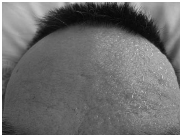
FIGURE 2. Profuse unilateral hyperhidrosis with a clear distinction along the midline of the face.

pareisis (right side was more severe than left side) and bilateral vertical nystagmus with conjugate gaze deviation to the left were noted. The right pupil was slightly smaller (2 mm) than the left (3 mm). No ptosis was evident, and the sweating function of the right side of the body was normal. During the course of hospitalization in our rehabilitation ward, we removed the Foley catheter and initiated an intermittent catheterization program for bladder training. Rapid onset of profuse hyperhidrosis over the left side of the face, neck, and upper trunk, as well as the left shoulder and left hand during bed rest was observed. The hyperhidrosis was most obvious on the face and hand, with a clear line of distinction along the midline of his face (Fig. 2). There were large drops of sweat dripping from these parts, and the pillow and clothes on his left side were wet due to the profuse sweating.