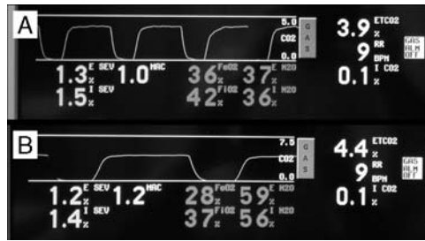
FIGURE 1. EtCO 2 and N 2 O values before (A) and after (B) changing the gas analyzer module.

of the adjacent nature of their filters on the wheel, it can be surmised that a problem in any of these filters might affect the other.