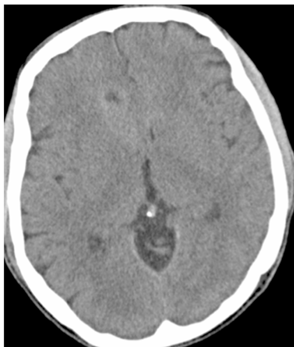
Figure 2 Preoperative non-contrast axial computed tomography showing a hypodense lesion with peripheral bleeding in the right anterior cingulate gyrus.

lower extremity hypertrophy, left foot, leg and ear gigantism and left-sided abdominal capillary hemangiomas were noted upon physical examination (Figure 1A, B, C). A head computerized tomography (CT) scan without contrast was obtained, showing a hypodense lesion with peripheral bleeding in the anteromedial right frontal lobe (Figure 2). Cranial magnetic resonance imaging (MRI) showed a heterogeneous lesion in the cingulate gyrus, with peripheral and central areas of T1 hyperintensity and layering T2 hypointensity consistent with the hemorrhage. There was minimal rim enhancement along