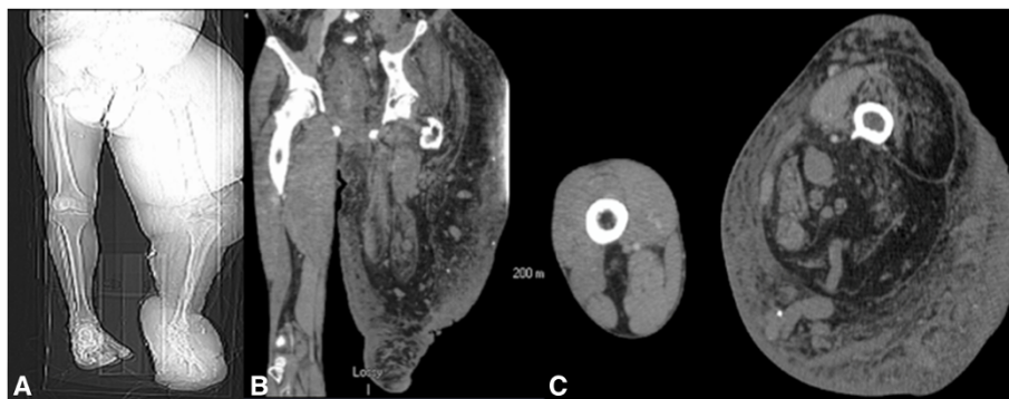
Figure 1 Pilot image (A) and the computed tomography scan with coronal (B) and axial (C) cuts of the left lower extremity showing hypertrophy of the left leg.

lower extremity hypertrophy, left foot, leg and ear gigantism and left-sided abdominal capillary hemangiomas were noted upon physical examination (Figure 1A, B, C). A head computerized tomography (CT) scan without contrast was obtained, showing a hypodense lesion with peripheral bleeding in the anteromedial right frontal lobe (Figure 2). Cranial magnetic resonance imaging (MRI) showed a heterogeneous lesion in the cingulate gyrus, with peripheral and central areas of T1 hyperintensity and layering T2 hypointensity consistent with the hemorrhage. There was minimal rim enhancement along