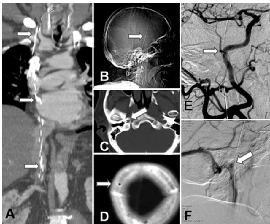
FIG. 3. A: CT angiogram showing the intracaval trajectory of the guidewire. B: Scout CT scan showing the intracranial trajectory of the metallic wire. C and D: CT scans showing passage at right foramen lacerum (C) and frontal point of exteriorization (D). E: DS angiogram in the arterial phase confirming the normal lumen of the lacerum segment of right internal carotid artery in close contact with the guidewire. F: DS angiogram in the venous phase showing the course of the guidewire passing through the jugular vein. Arrows show the trajectory of the guidewire.

brain hemorrhage. Earlier identification of the retained guidewire might have prevented the fatal outcome.