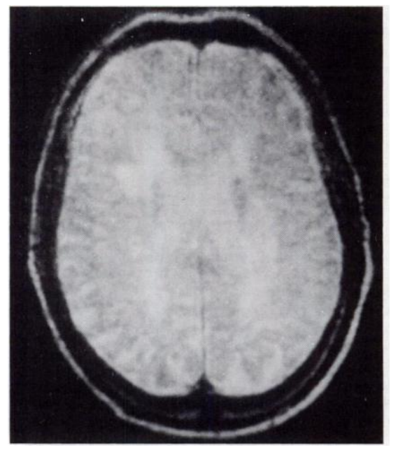
Fig. 2 T<sub>2</sub>-weighted MRI scan from case 2 shows increased signal in subfrontal, subparietal, and suboccipital white matter.

A 72-year-old man was admitted to hospital because he was being increasingly aggressive at his board-and-care home, where he had hit some of his fellow boarders. His personal hygiene had deteriorated, and he had been incontinent