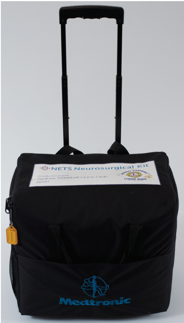
FIG. 2. Mobile pediatric neurosurgical kit. Figure is available in color online only.