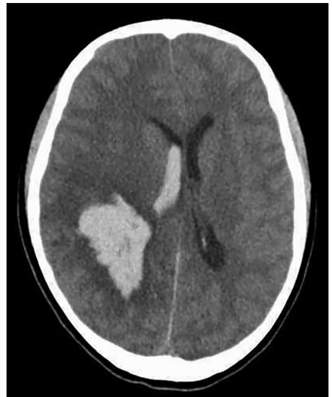
FIG. 4. Case 2. A CT image of an 11-year-old girl demonstrating right ICH with midline shift and intraventricular extension.

Hospital accreditation was addressed through the well-established precedents as being an extension of an NETS team, appropriately tasked by the usual NETS process. Nonsurgical services provided by NETS are already pro-