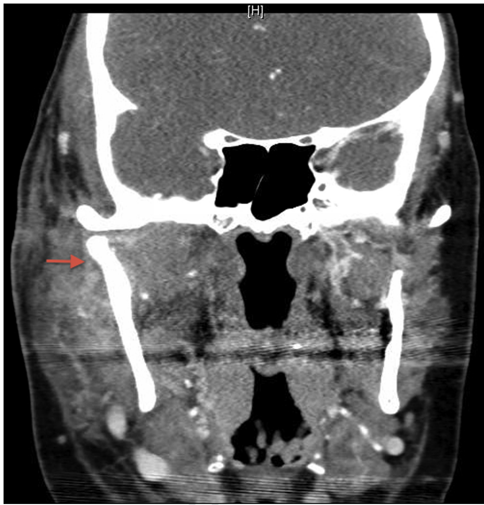
FIGURE 3. Case 2. Preoperative maxillofacial contrast-enhanced coronal computed tomogram on day 49 displays a periosteal submasseteric abscess (arrow) at the mandibular ramus communicating with the temporomandibular joint.

Lohiya and Dillon. Septic Arthritis of Temporomandibular Joint. J Oral Maxillofac Surg 2015.