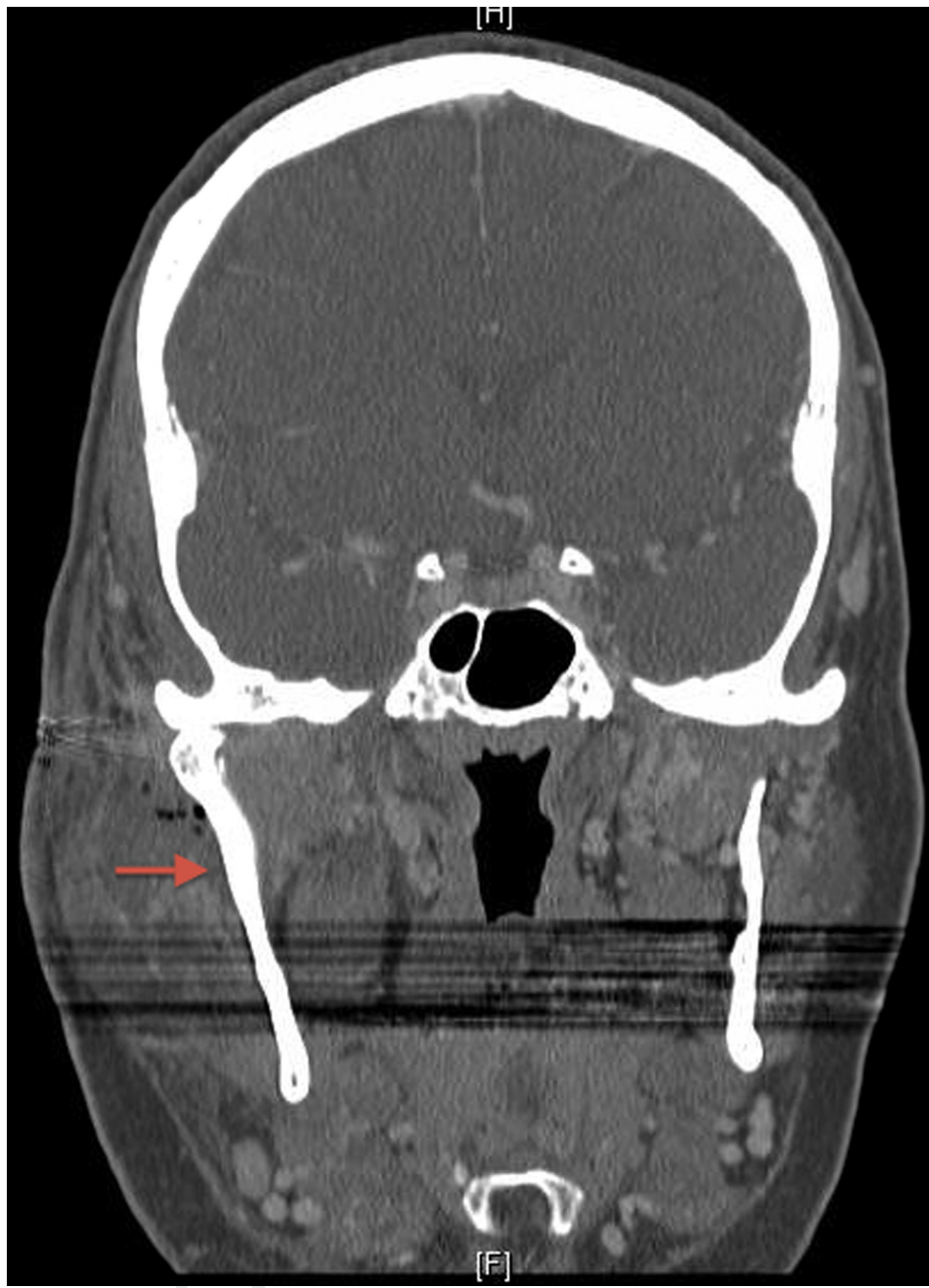
FIGURE 4. Case 2. Maxillofacial contrast-enhanced coronal computed tomogram on day 58 after the first surgery, but before the second surgery, shows a residual abscess (arrow) lateral to the right condyle.

Lobiya and Dillon. Septic Arthritis of Temporomandibular Joint. J Oral Maxillofac Surg 2015.