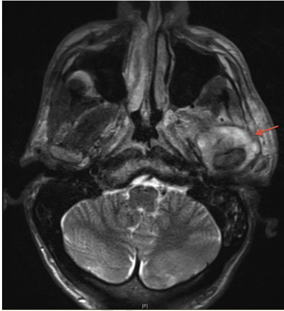
FIGURE 1. Case 1. Preoperative maxillofacial contrast T2-weighted magnetic resonance image on day 30 shows fluid collection (arrow) adjacent to the left temporomandibular joint with marked enhancement in the periphery of the collection, adjacent soft tissues, and muscles of the masticator space suggestive of infectious etiology.

Lohiya and Dillon. Septic Arthritis of Temporomandibular Joint. J Oral Maxillofac Surg 2015.